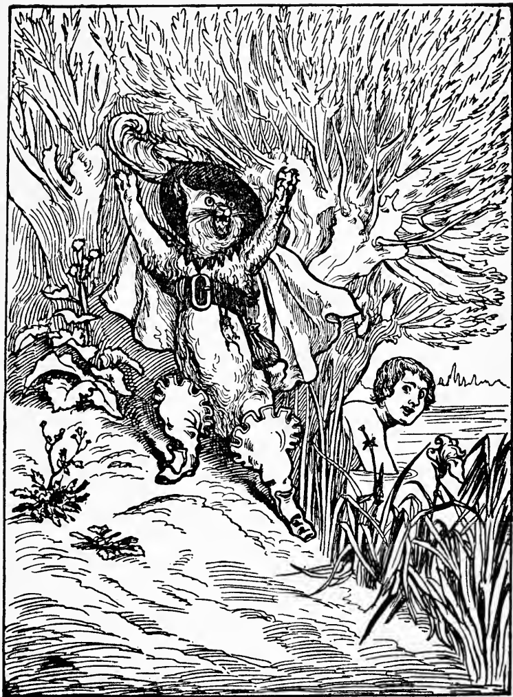
"THE MARQUIS OF CARABAS IS DROWNING!"